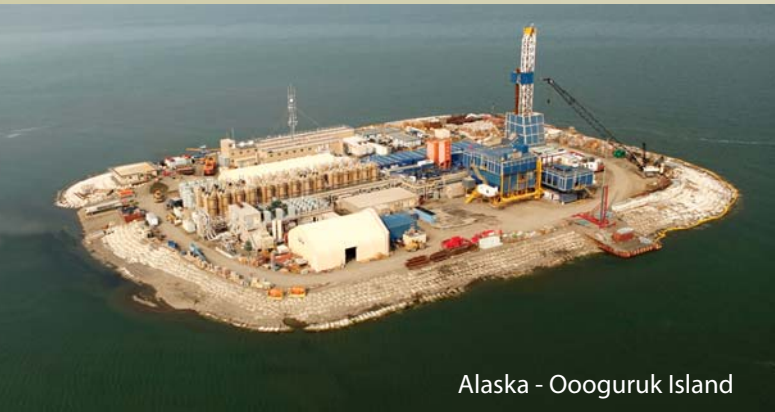
Alaska - Oooguruk Island